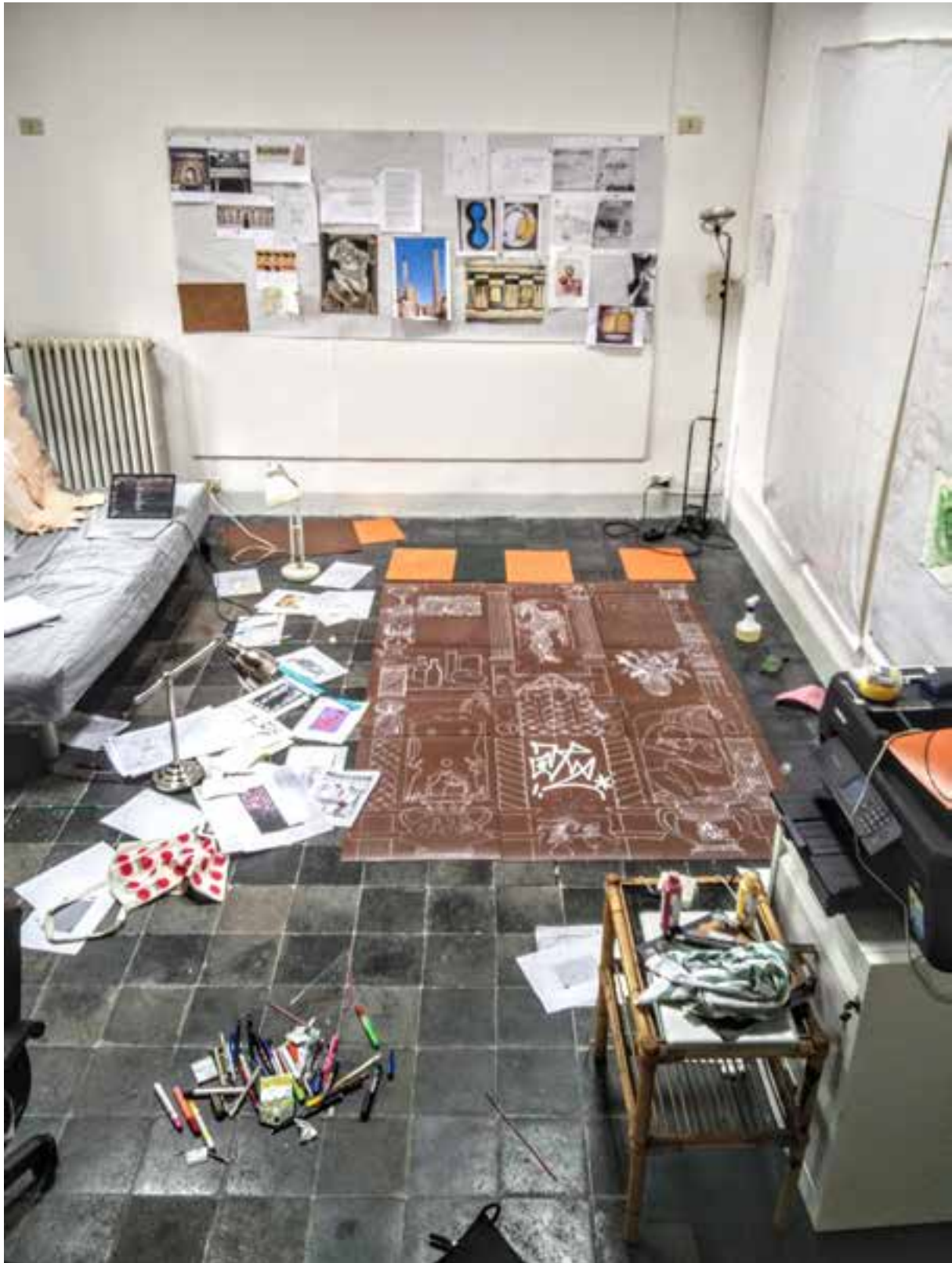
Dina Danish & Jean-Baptiste Maitre studio view at the American Academy in Rome, november 2019 view of the carved linoleum plates in progress on the floor view of the research material on the wall